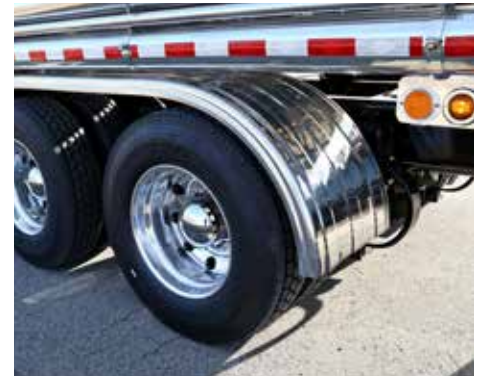
STYLISH RIBBED FENDERS