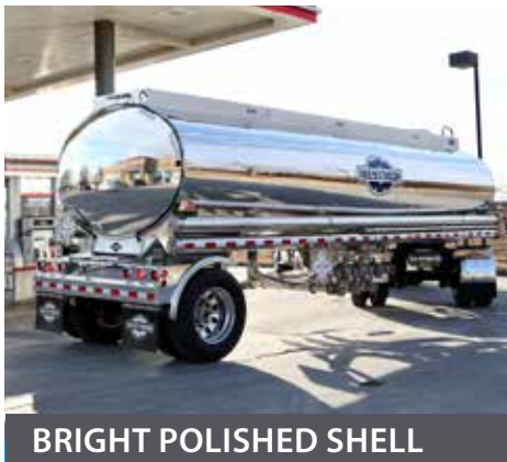
BRIGHT POLISHED SHELL