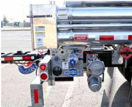
SIMPLE CONTROL PANELS