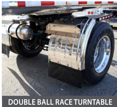
DOUBLE BALL RACE TURNTABLE