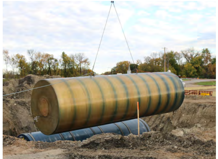
MANUFACTURING AND INSTALLATION