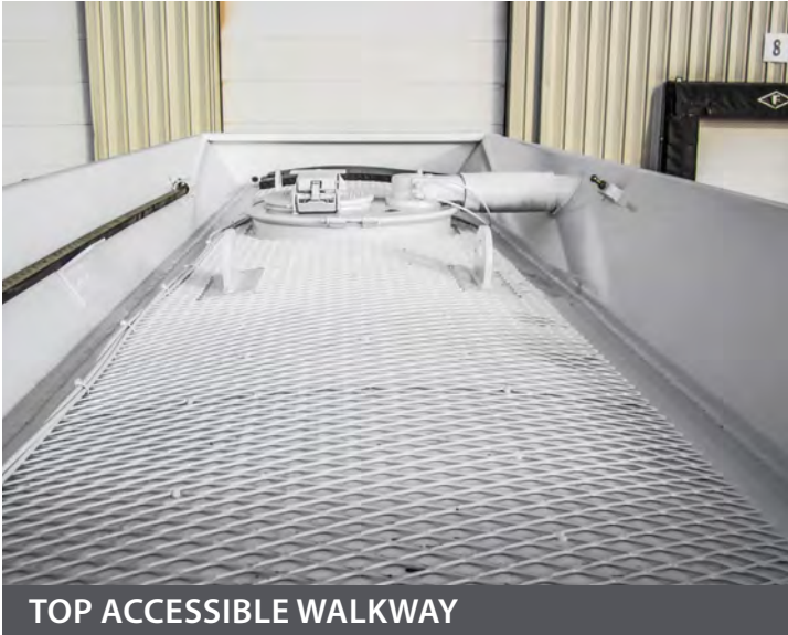
TOP ACCESSIBLE WALKWAY