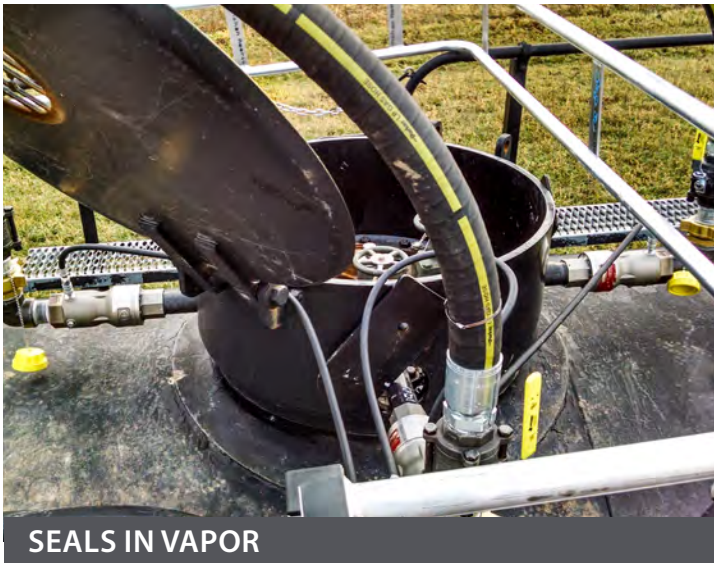
SEALS IN VAPOR